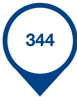
Gardaí returned to the frontline