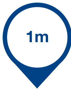
followers reached across Garda social media